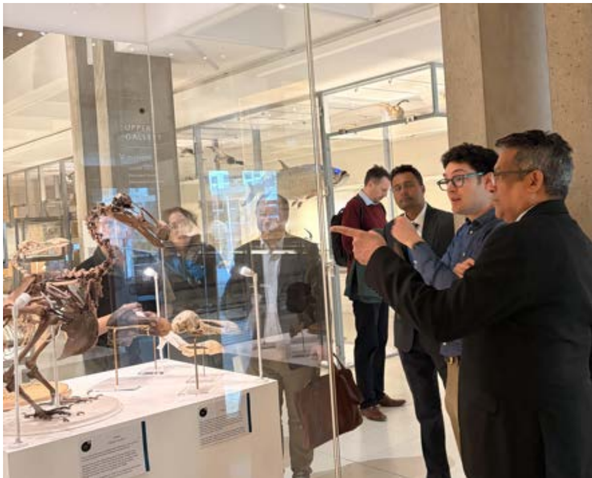
Dodo Viewing with the High Commissioner of Mauritius at the Museum of Zoology, Cambridge