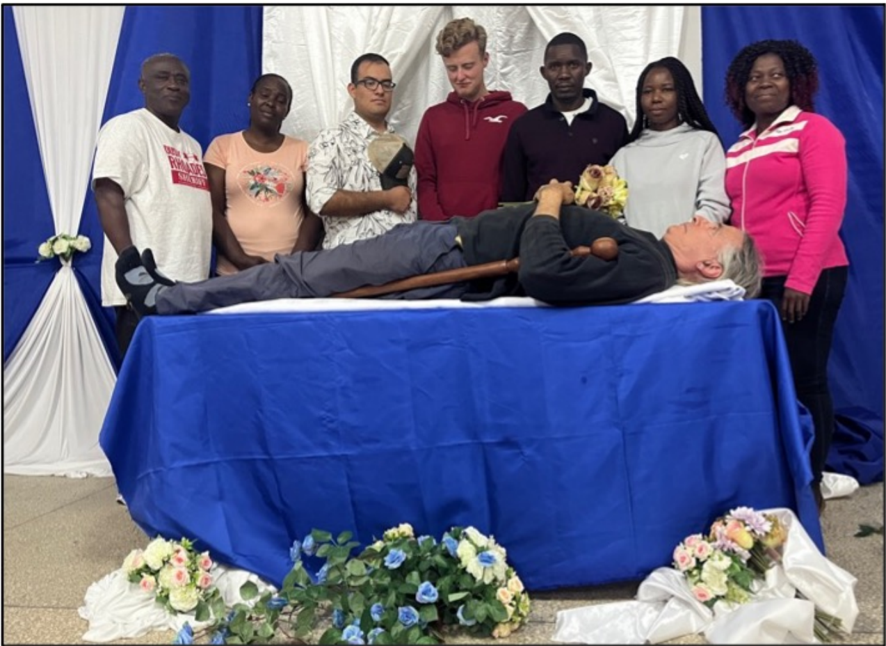
Demonstration of the consequences of not being snake aware while pursuing dendochronology.